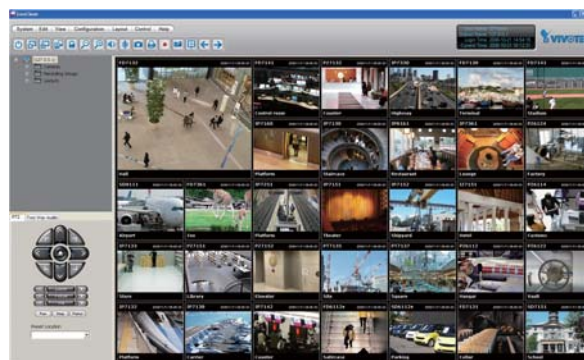
32-channel Live Video Monitoring